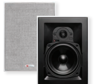
HSi 255 2-Way 5<sup>1</sup>/<sub>4</sub>" In-Wall Speaker